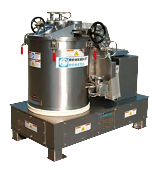
DRC 50 Vx 2S man