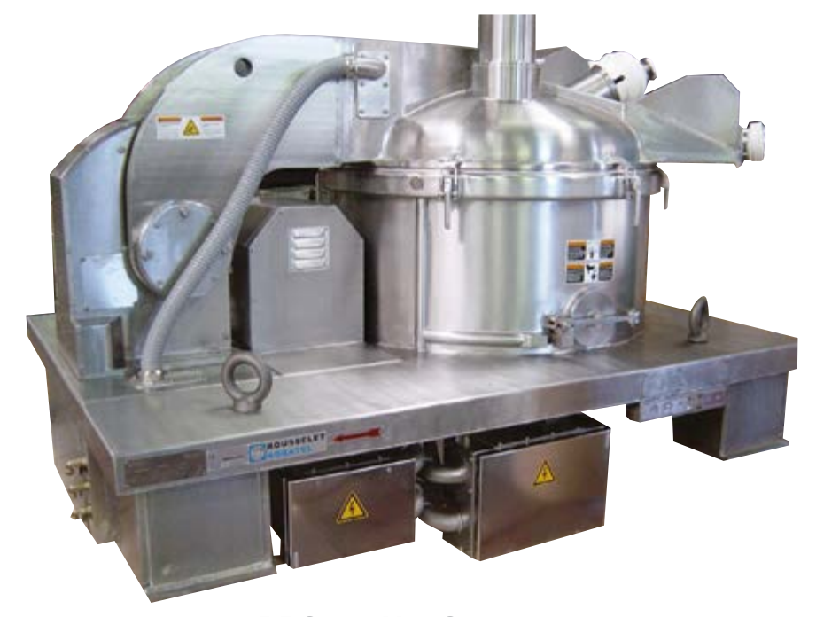
DRC 100 Vx 2S mot