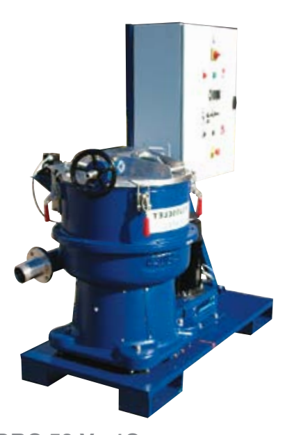
DRC 50 Vx 1S man