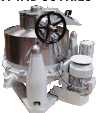
DSC 70 1S man